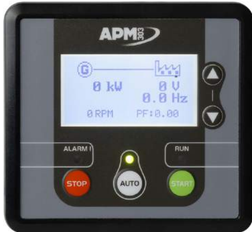
APM303, comprehensive and simple

The APM303 is a versatile unit which can be operated in manual or automatic mode. It offers the following features: Measurements: phase-to-neutral and phase-to-phase voltages, fuel level (In option : active power currents, effective power, power factors, Kw/h energy meter, oil pressure and coolant temperature levels) Supervision: Modbus RTU communication on RS485 Reports: (In option : 2 configurable reports) Safety features: Overspeed, oil pressure, coolant temperatures, minimum and maximum voltage, minimum and maximum frequency (Maximum active power P<66kVA) Traceability: Stack of 12 stored events For further information, please refer to the data sheet for the APM303.